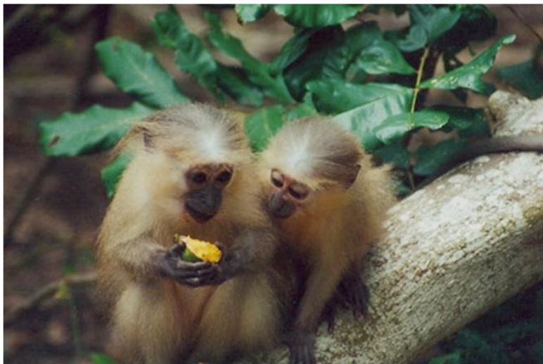
Critically endangered Tana River mangabey ( Cercocebus galeritus )

The 2001 primate census results (Suleman, Oguge & Wahungu, 2001) suggest a decline of the red colobus by one third from the previous census population estimate of 1994. The primates are important flagship species for this biodiversity hotspot. Though relatively tiny, this biodiversity hotspot boasts three endemic monkey species. Found only in small patches of gallery forest along the lower Tana River in Kenya, the Tana River red colobus ( Procolobus rufomitratu s) is represented by only about 736-838 individuals, while the Tana River mangabey ( Cercocebus galeritu s) has been reduced to only about 1783-2135 individuals (Suleman, Oguge & Wahungu, 2001).