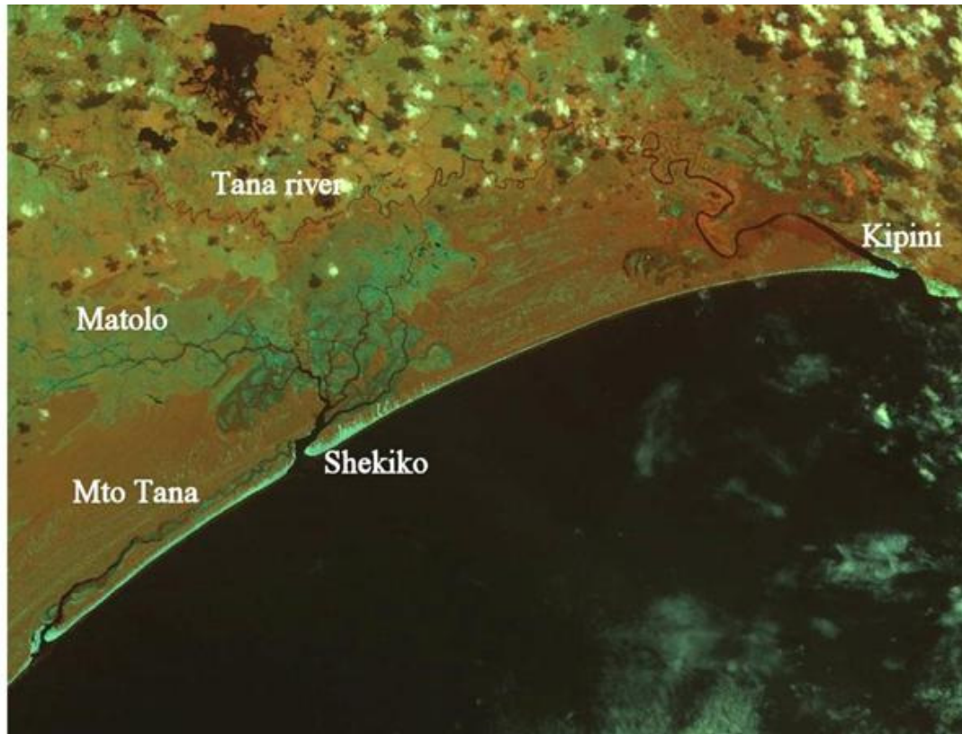
Plate: The mouth of Tana Delta at Ungwana Bay ( http://www.vub.ac.be/ANCH/CV/tana.html ).